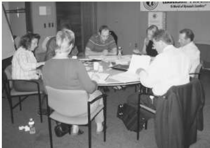
AALP participants work as teams during the GridWorks seminar.

One of the highlights of Class 11's first session was the GridWorks Seminar, a workshop designed to show individuals how their behavior affects others in the workplace. Specifically, the seminar looks at practicing critique, advocating convictions, making decisions, and