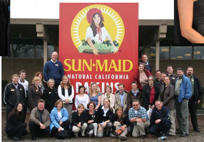
(Left) Class 12 during their North American Study Tour to California in February/March 2009