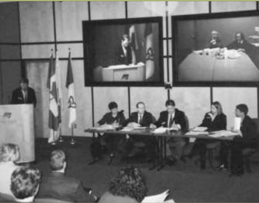
At their Sudbury seminar, Class Nine participated in a mock tribunal exercise, using video conferencing technology to link with panellists in Guelph.

It's recruitment time again. Applications for Class 10 are due on March 7, 2003 (note change from May) so we're actively trying to get the word out to qualified candidates across the province.