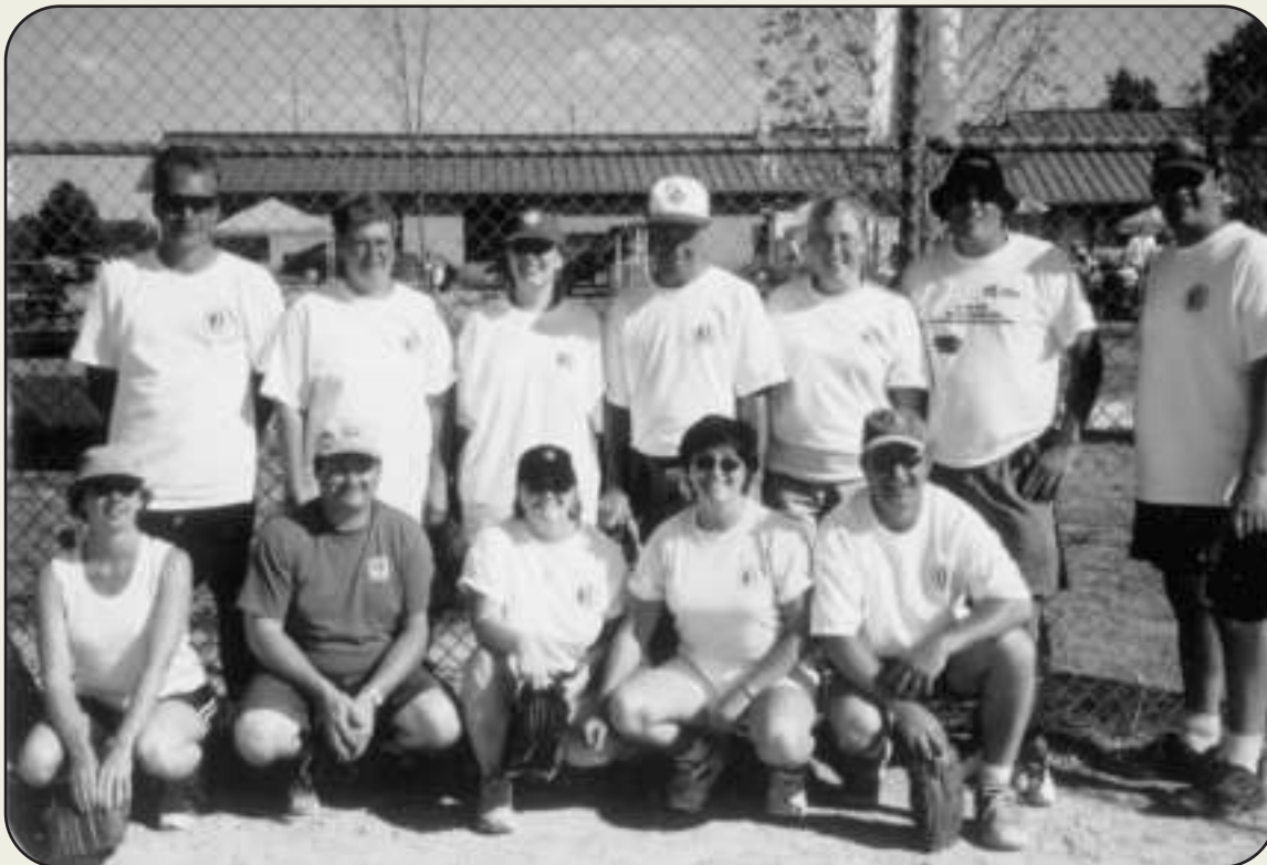
Ontario Cattlemen's Association baseball team at Pitch'n for AALP tournament.

Class Nine plans to host a second tournament in August of 2003 before turning the reins over to Class 10. The date has yet to be confirmed.